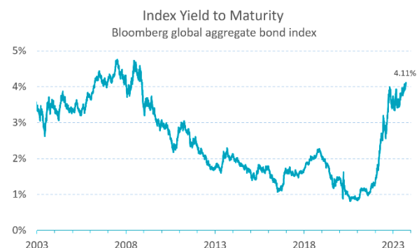
Figure 1 – Index yield has now exceeded 4%

Credit markets have continued to do well in the past few months, as spreads benefitted from the soft-landing narrative. Nonetheless, we expect the impact of policy tightening to start manifesting in the broader economy amid decelerating growth and tougher lending environments. Hence some caution is warranted. This is reflected in a somewhat conservative portfolio corporate credit beta, which is close to 1. Moving forward, we continue to believe that Euro swaps spreads and highly rated Euro SSA paper provide opportunities.